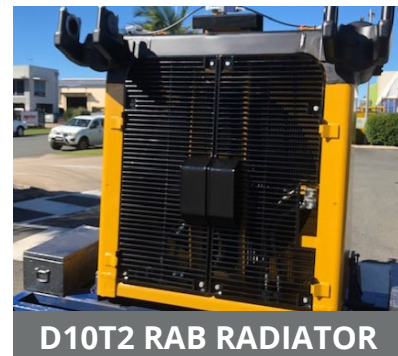
D10T2 RAB RADIATOR