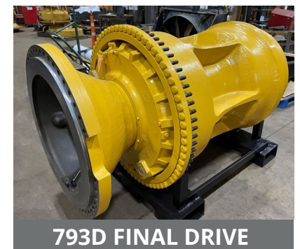
793D FINAL DRIVE