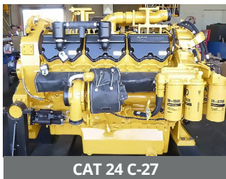
CAT 24 C-27