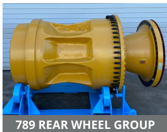
789 REAR WHEEL GROUP

Our solutions help you maximize uptime and minimize costs over the life of your equipment