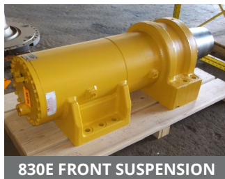
830E FRONT SUSPENSION