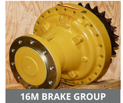
16M BRAKE GROUP