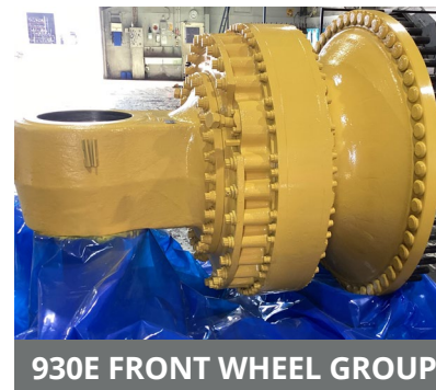
930E FRONT WHEEL GROUP